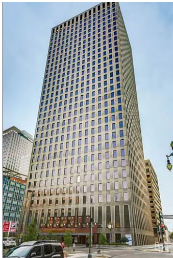
1010 Common Street, New Orleans CBD - 2019 (High-Rise Office with Parking Garage)