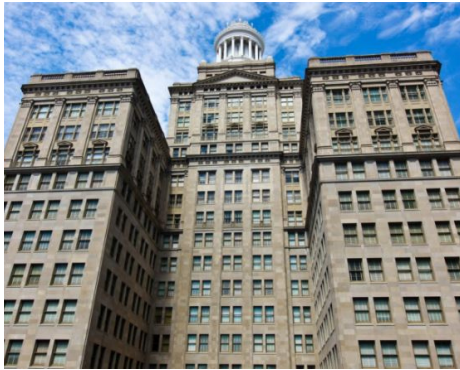
Hibernia Tower, New Orleans, LA - July 2020 (Multi-Family & Ground Floor Retail)