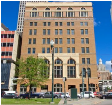
The Pythian, New Orleans, LA - 2020 (Multi-Family & Ground Floor Retail)