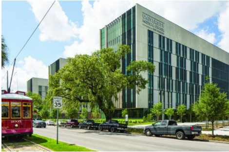
UMC Hospital Market Rent Study, New Orleans, LA 2015-2020 (Medical Office, Office, and Retail)