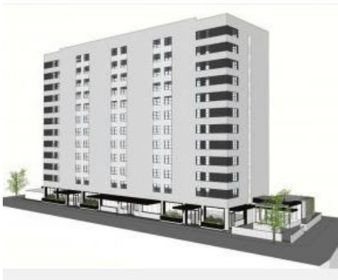
The Warwick Hotel, New Orleans, LA - 2020 (Student Housing & Ground Floor Retail)