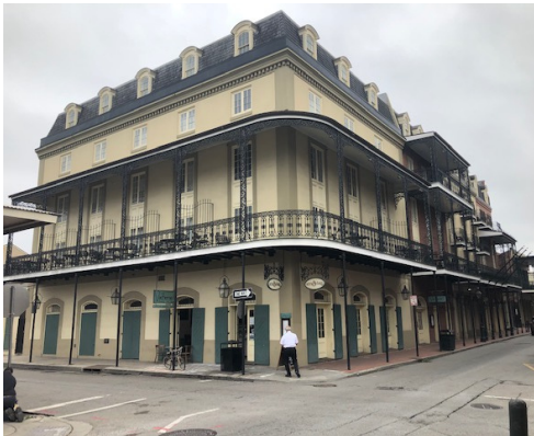
Hotel St. Marie, New Orleans, LA - January 2021