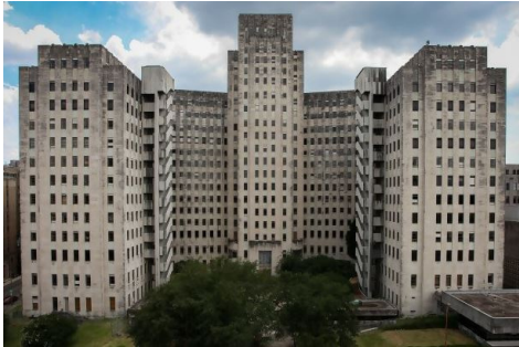
Charity Hospital Retail Market Rent Study, New Orleans, LA 2020 (Ground Floor Retail)