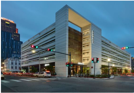
South Market District Parking Garage, New Orleans, LA- 2015 (Parking Garage & Ground Floor Retail)