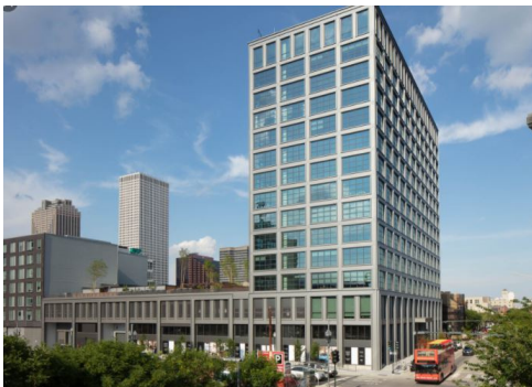
The Standard, South Market District, New Orleans, LA - 2019 (Ground Floor Retail)