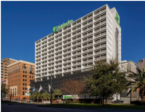
Holiday Inn Superdome, New Orleans, LA - January 2021