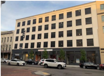
618 Magazine Street Parking Garage, New Orleans, LA - 2019 (Parking Garage & Ground Floor Retail)