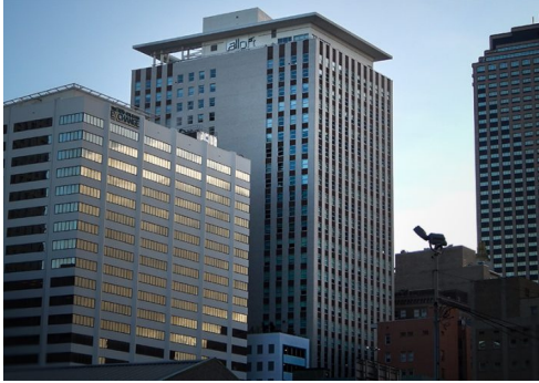
Aloft Hotel, New Orleans, LA - July 2020